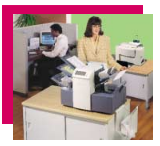
The 3 Series<sup>™</sup> fits perfectly into your office environment.